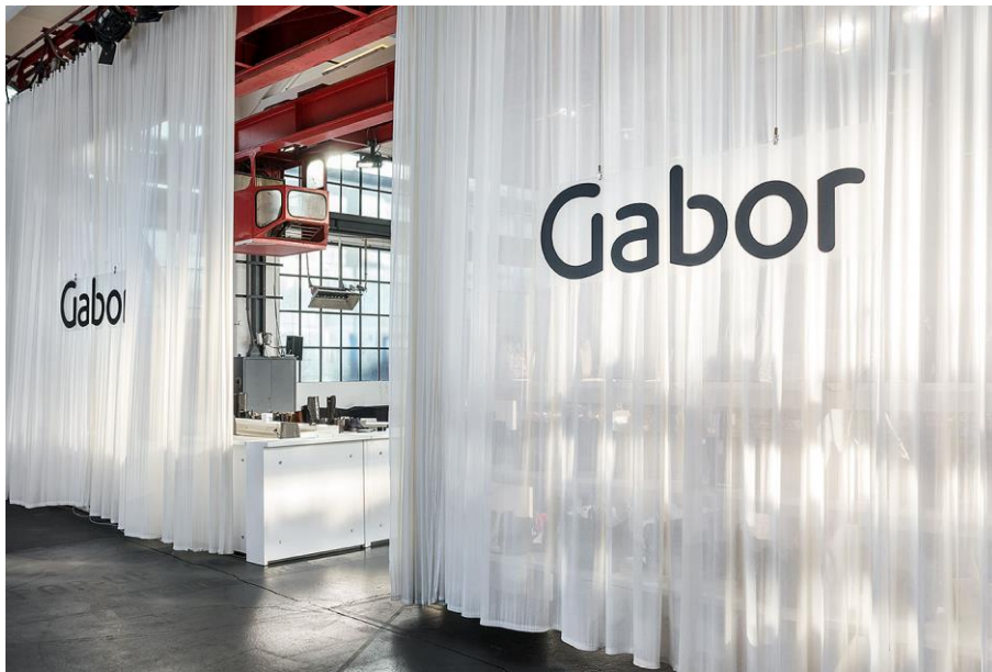
IMG_3167: In a former industrial hall of Areal Böhler in Dusseldorf Dart stages the traditional brand Gabor at the first Gallery SHOES.